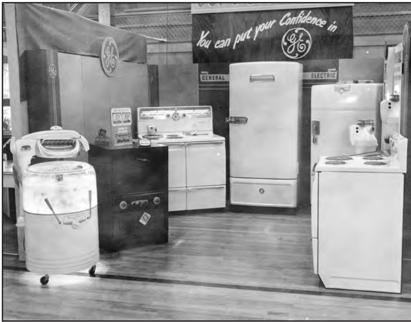
The fair and home shows were great places to promote the sale of appliances to Kootenai Electric customers. Notice the clear tub on the washing machine, 1951. Dom-4-3

to a division point where it broke north and south to Bayview and Conkling Park, totaling 185 miles of line, serving 385 members. A public party to celebrate Kootenai REA turning on the first lights in May 1939 was held at the Coeur d'Alene Civic Auditorium.