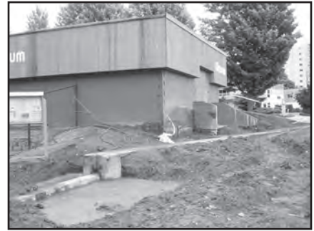
City workers removed a tree and dirt to expose the 1940s dike. In the foreground is where the railroad track came through. Workers filled it with concrete, Sept. 2013.

The museum's quarterly newsletter featuring historical articles and Museum news reaches about 1,000 people. Since April 2011 the Nickel's Worth has published a weekly Museum photo.