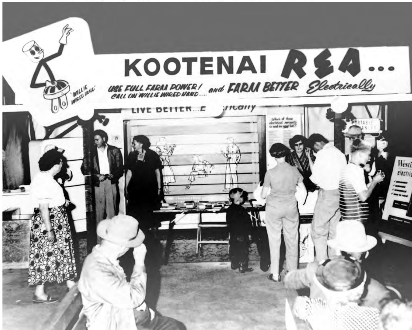
Kootenai Electric fair booth about 1950. UT-2-3